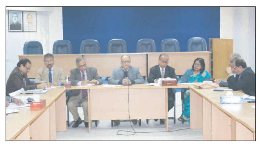
UGC Chairman addressing at a meeting of HEQEP