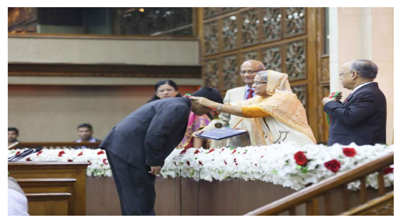
The Hon'ble Prime Minister Sheikh Hasina awarding Prime Minister Gold Medal to a graduate at the Prime Minister Gold Medal Award Ceremony on 6 January 2016